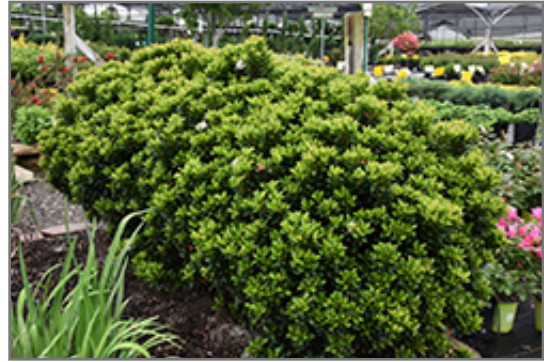
Dwarf Yeddo Hawthorn

Dwarf Yeddo Hawthorn is recommended for the following landscape applications;