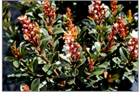
Dwarf Yeddo Hawthorn flowers

This shrub does best in full sun to partial shade. It prefers to grow in average to moist conditions, and shouldn't be allowed to dry out. It is not particular as to soil type or pH. It is somewhat tolerant of urban pollution. This is a selected variety of a species not originally from North America.