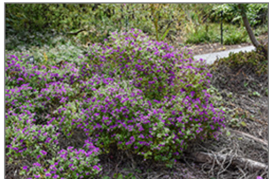
Petite Butterfly Sweet Pea Shrub flowers