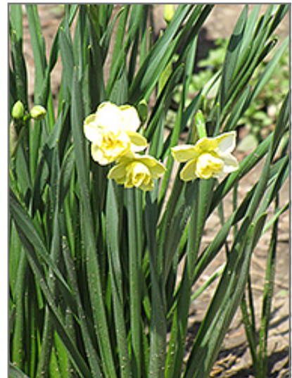
Yellow Cheerfulness Daffodil in bloom