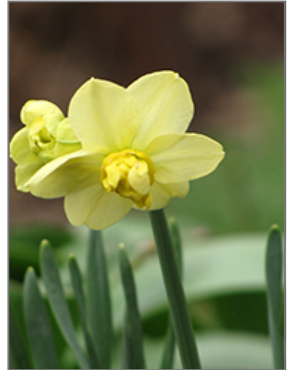
Yellow Cheerfulness Daffodil flowers

Yellow Cheerfulness Daffodil is recommended for the following landscape applications;