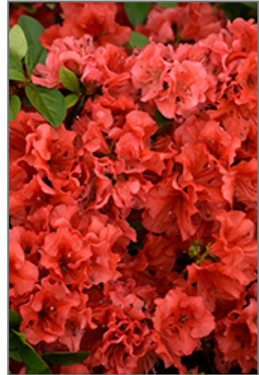
Girard's Hot Shot Azalea flowers