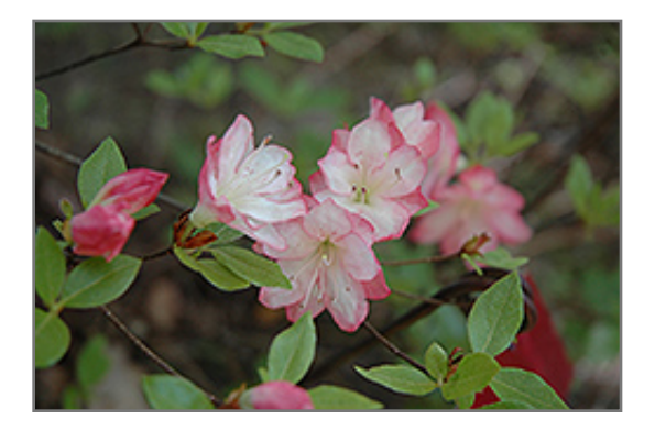
Apple Blossom Azalea flowers