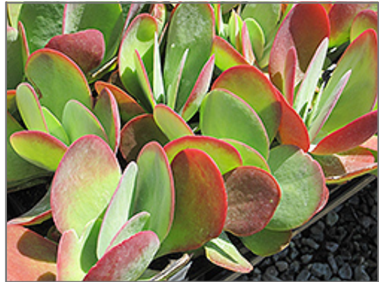
Paddle Plant

Paddle Plant will grow to be about 24 inches tall at maturity extending to 3 feet tall with the flowers, with a spread of 24 inches. When grown in masses or used as a bedding plant, individual plants should be spaced approximately 18 inches apart. Its foliage tends to remain dense right to the ground, not requiring facer plants in front. It grows at a slow rate, and under ideal conditions can be expected to live for approximately 10 years. As an evergreen perennial, this plant will typically keep its form and foliage year-round.