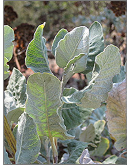
St. Catherine's Lace foliage

This shrub does best in full sun to partial shade. It prefers dry to average moisture levels with very well-drained soil, and will often die in standing water. It is considered to be drought-tolerant, and thus makes an ideal choice for xeriscaping or the moisture-conserving landscape. It is not particular as to soil pH, but grows best in poor soils, and is able to handle environmental salt. It is highly tolerant of urban pollution and will even thrive in inner city environments. This species is native to parts of North America.