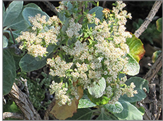
St. Catherine's Lace flowers

St. Catherine's Lace is recommended for the following landscape applications;