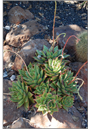
Molded Wax Echeveria

Molded Wax Echeveria is a fine choice for the garden, but it is also a good selection for planting in outdoor pots and containers. It is often used as a 'filler' in the 'spiller-thriller-filler' container combination, providing a mass of flowers and foliage against which the larger thriller plants stand out. Note that when growing plants in outdoor containers and baskets, they may require more frequent waterings than they would in the yard or garden.