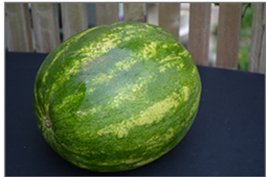
Solitaire Watermelon fruit