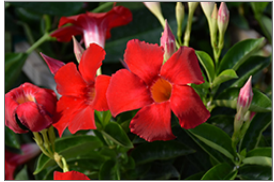
Sundenia Red Mandevilla flowers