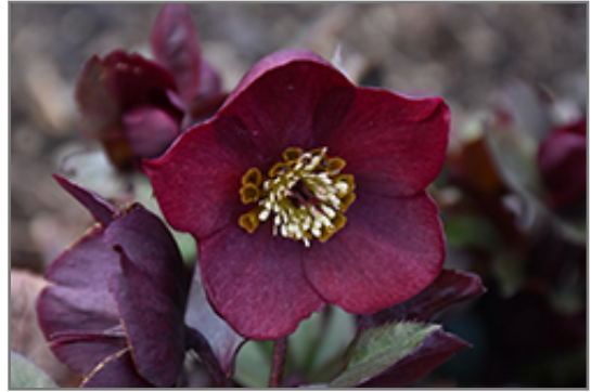
Honeymoon Rome In Red Hellebore flowers