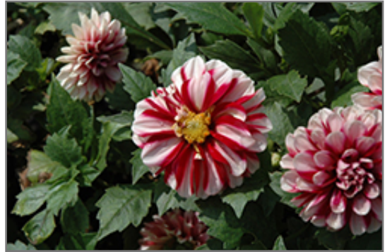
Dalaya Dark Red and White Dahlia flowers