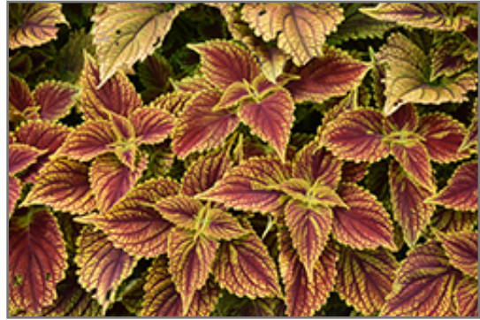
ColorBlaze Golden Dreams Coleus foliage