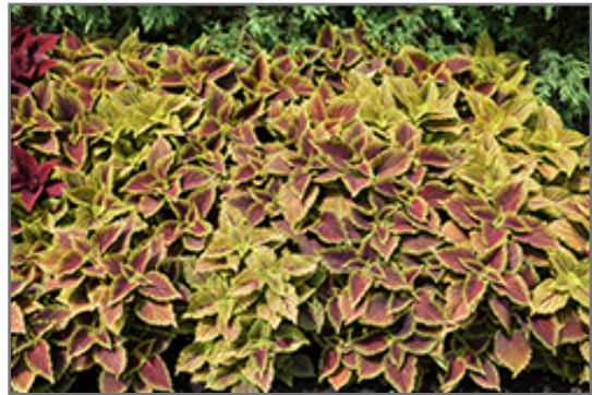
ColorBlaze Golden Dreams Coleus