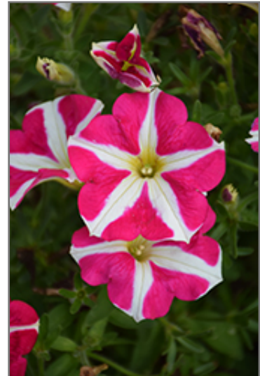
Amore Pink Heart Petunia flowers