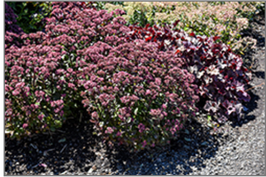
Double Martini Stonecrop in bloom