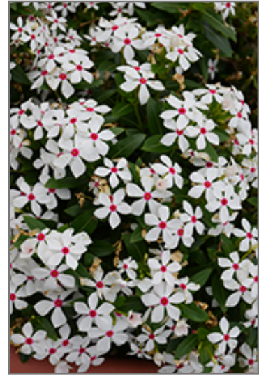
Soiree Kawaii White Peppermint Vinca flowers

Soiree Kawaii White Peppermint Vinca is a fine choice for the garden, but it is also a good selection for planting in outdoor containers and hanging baskets. Because of its trailing habit of growth, it is ideally suited for use as a 'spiller' in the 'spiller-thriller-filler' container combination; plant it near the edges where it can spill gracefully over the pot. Note that when growing plants in outdoor containers and baskets, they may require more frequent waterings than they would in the yard or garden.