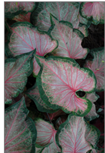
Heart to Heart Chinook Caladium foliage