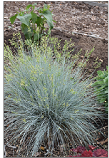
Blue Whiskers Blue Fescue