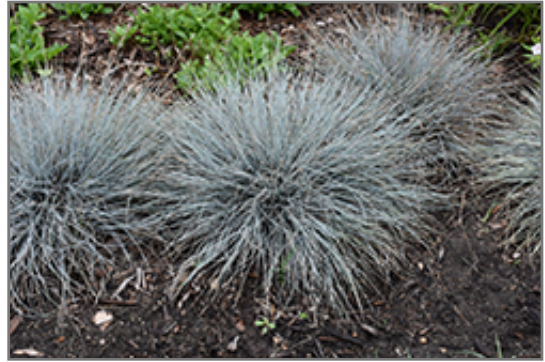
Blue Whiskers Blue Fescue

Blue Whiskers Blue Fescue will grow to be about 12 inches tall at maturity extending to 20 inches tall with the flowers, with a spread of 24 inches. Its foliage tends to remain dense right to the ground, not requiring facer plants in front. It grows at a medium rate, and under ideal conditions can be expected to live for approximately 8 years. As an evergreen perennial, this plant will typically keep its form and foliage year-round.