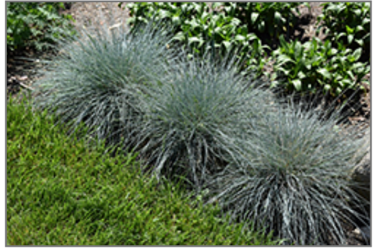
Blue Whiskers Blue Fescue

Blue Whiskers Blue Fescue is recommended for the following landscape applications;