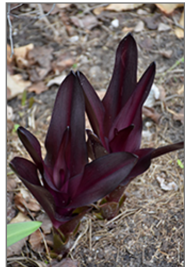
African Night Pineapple Lily