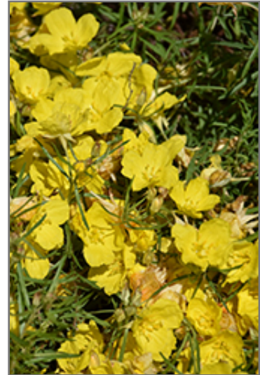
Yellow Sundrops flowers