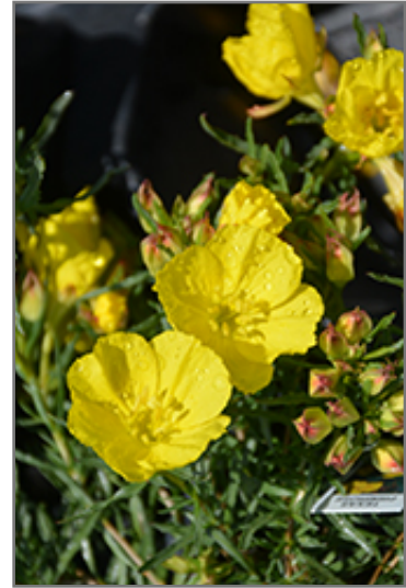
Yellow Sundrops flowers

Yellow Sundrops is a fine choice for the garden, but it is also a good selection for planting in outdoor pots and containers. Because of its spreading habit of growth, it is ideally suited for use as a 'spiller' in the 'spiller-thriller-filler' container combination; plant it near the edges where it can spill gracefully over the pot. Note that when growing plants in outdoor containers and baskets, they may require more frequent waterings than they would in the yard or garden.