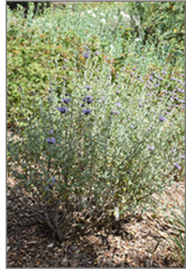
Allen Chickering Sage in bloom

This shrub should only be grown in full sunlight. It prefers dry to average moisture levels with very well-drained soil, and will often die in standing water. It is considered to be drought-tolerant, and thus makes an ideal choice for xeriscaping or the moisture-conserving landscape. It is not particular as to soil type or pH. It is somewhat tolerant of urban pollution. This particular variety is an interspecific hybrid. It can be propagated by cuttings; however, as a cultivated variety, be aware that it may be subject to certain restrictions or prohibitions on propagation.