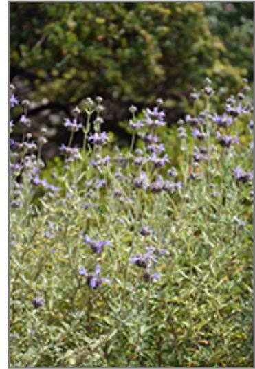
Allen Chickering Sage flowers

Allen Chickering Sage is recommended for the following landscape applications;