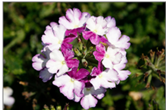
Firehouse Purple Fizz Verbena flowers