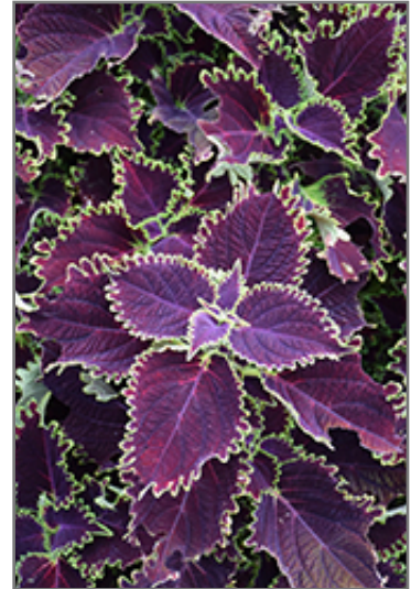
ColorBlaze Wicked Witch Coleus foliage