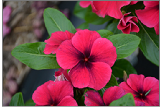
Tattoo Black Cherry Vinca flowers

Tattoo Black Cherry Vinca is a dense herbaceous evergreen perennial with a mounded form. Its medium texture blends into the garden, but can always be balanced by a couple of finer or coarser plants for an effective composition.