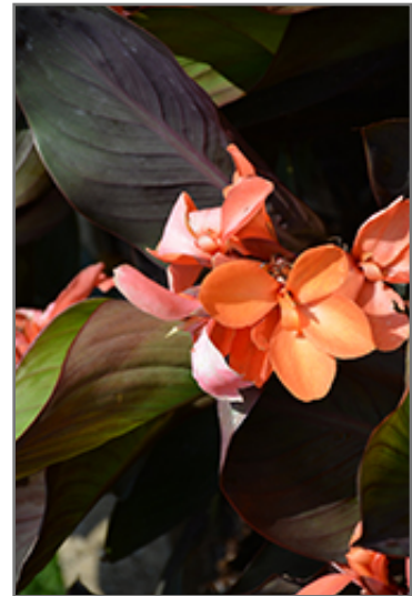
CannaSol Happy Wilma Canna flowers

This plant is native to the tropics and prefers growing in moist environments with evenly warm conditions all year round. In our climate, it is usually grown as an outdoor annual in the garden or in a container. If you want it to survive the winter, it can be brought in to the house and provided with special care, and then returned to the garden the following season. In its preferred tropical habitat, it can grow to be around 18 inches tall at maturity, with a spread of 14 inches. However, when grown as an annual or when overwintered indoors, it can be expected to perform differently, and its exact height and spread will depend on many factors; you may wish to consult with our experts as to how it might perform in your specific application and growing conditions.