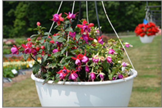
Bella Fuchsia Nora Fuchsia in bloom