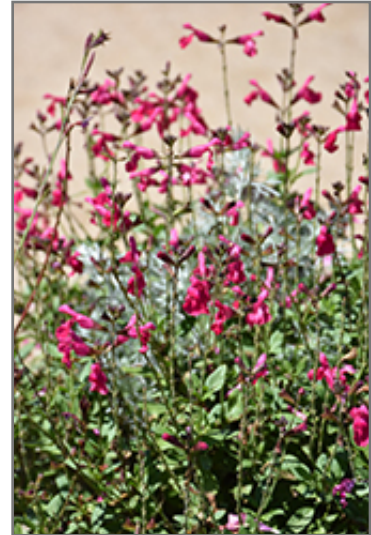
Mirage Hot Pink Autumn Sage flowers

Mirage Hot Pink Autumn Sage is a fine choice for the garden, but it is also a good selection for planting in outdoor pots and containers. It is often used as a 'filler' in the 'spiller-thriller-filler' container combination, providing a mass of flowers against which the larger thriller plants stand out. Note that when growing plants in outdoor containers and baskets, they may require more frequent waterings than they would in the yard or garden.