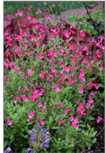
Mirage Hot Pink Autumn Sage flowers

Mirage Hot Pink Autumn Sage is an herbaceous evergreen perennial with an upright spreading habit of growth. Its medium texture blends into the garden, but can always be balanced by a couple of finer or coarser plants for an effective composition.