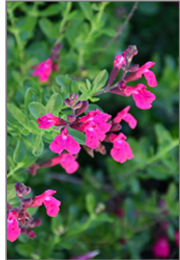
Mirage Hot Pink Autumn Sage flowers

Mirage Hot Pink Autumn Sage is an herbaceous evergreen perennial with an upright spreading habit of growth. Its medium texture blends into the garden, but can always be balanced by a couple of finer or coarser plants for an effective composition.