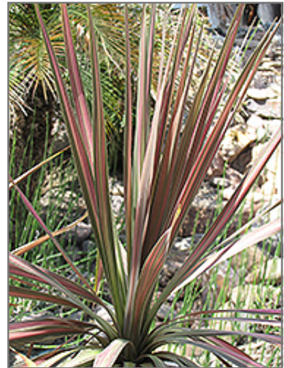
Pink Stripe Cabbage Palm

This tropical plant does best in full sun to partial shade. It does best in average to evenly moist conditions, but will not tolerate standing water. It is not particular as to soil type or pH, and is able to handle environmental salt. It is somewhat tolerant of urban pollution. This is a selected variety of a species not originally from North America.