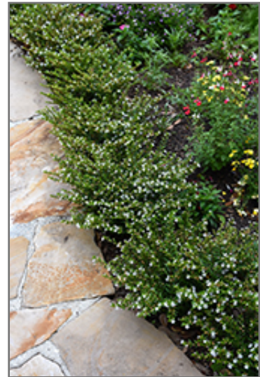
FloriGlory Maria Mexican Heather flowers