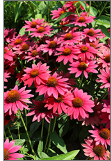
Sombrero Tres Amigos Coneflower flowers

This is a relatively low maintenance plant, and is best cleaned up in early spring before it resumes active growth for the season. It is a good choice for attracting butterflies to your yard, but is not particularly attractive to deer who tend to leave it alone in favor of tastier treats. It has no significant negative characteristics.