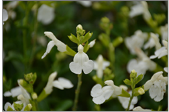
Mirage White Autumn Sage flowers

This is a relatively low maintenance plant, and should only be pruned after flowering to avoid removing any of the current season's flowers. It is a good choice for attracting bees, butterflies and hummingbirds to your yard, but is not particularly attractive to deer who tend to leave it alone in favor of tastier treats. It has no significant negative characteristics.