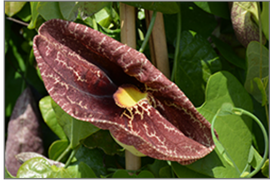
Giant Dutchman's Pipe flowers