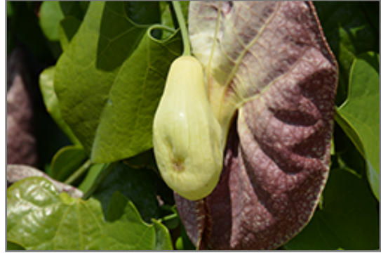
Giant Dutchman's Pipe flowers

This woody vine does best in full sun to partial shade. It prefers to grow in average to moist conditions, and shouldn't be allowed to dry out. It is not particular as to soil type or pH. It is highly tolerant of urban pollution and will even thrive in inner city environments. This species is not originally from North America.