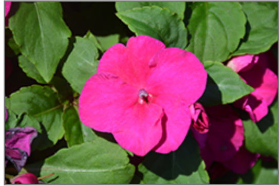
Accent Premium Violet Impatiens flowers

Accent Premium Violet Impatiens is recommended for the following landscape applications;