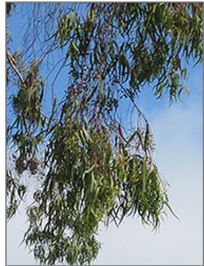
Lemon-scented Gum foliage