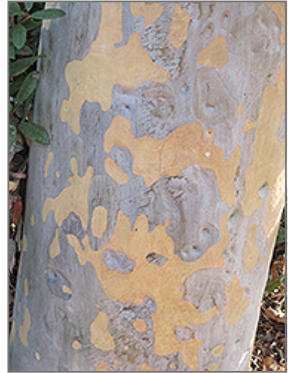
Lemon-scented Gum bark

This tree should only be grown in full sunlight. It prefers dry to average moisture levels with very well-drained soil, and will often die in standing water. It is particular about its soil conditions, with a strong preference for sandy, acidic soils, and is able to handle environmental salt. It is somewhat tolerant of urban pollution. This species is not originally from North America.