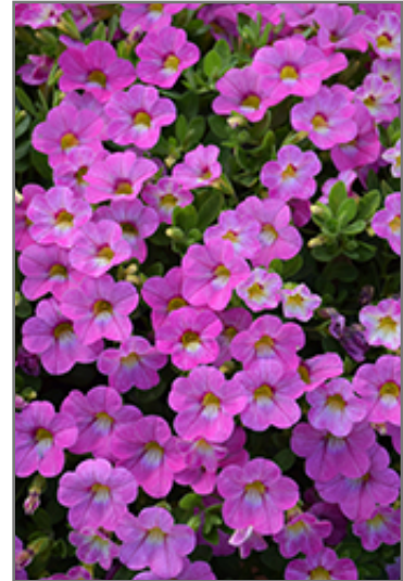
Chameleon Pink Passion Calibrachoa flowers

This plant will require occasional maintenance and upkeep. Trim off the flower heads after they fade and die to encourage more blooms late into the season. It is a good choice for attracting bees and hummingbirds to your yard, but is not particularly attractive to deer who tend to leave it alone in favor of tastier treats. It has no significant negative characteristics.