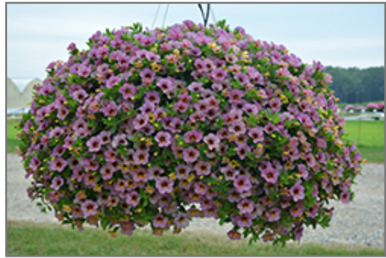
Chameleon Blueberry Scone Calibrachoa in bloom