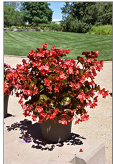
Megawatt Red Bronze Leaf Begonia flowers