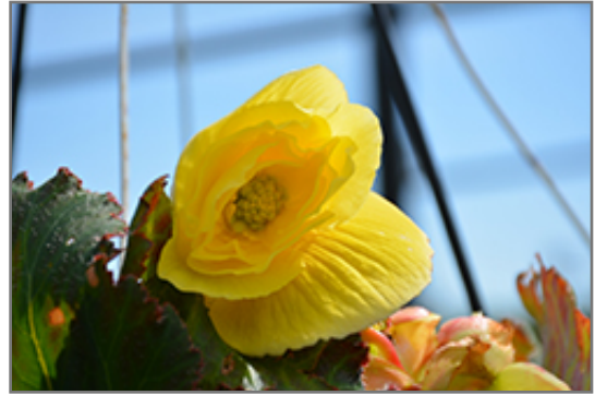
AmeriHybrid Ruffled Yellow Begonia flowers

AmeriHybrid Ruffled Yellow Begonia is recommended for the following landscape applications;