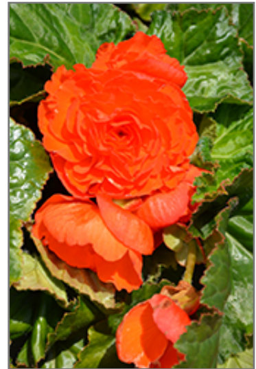
AmeriHybrid Ruffled Mandarin Orange Begonia flowers