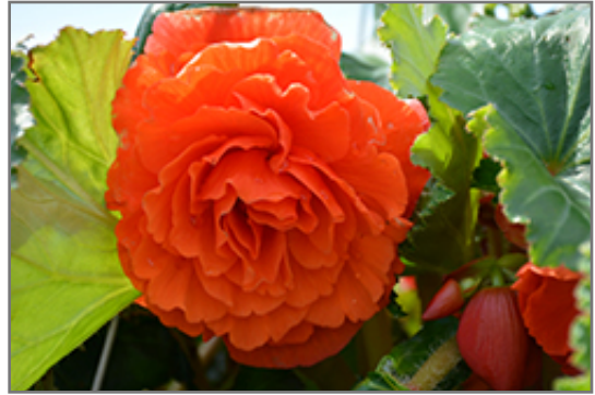
AmeriHybrid Ruffled Mandarin Orange Begonia flowers

This is a high maintenance plant that will require regular care and upkeep, and usually looks its best without pruning, although it will tolerate pruning. Deer don't particularly care for this plant and will usually leave it alone in favor of tastier treats. Gardeners should be aware of the following characteristic(s) that may warrant special consideration;