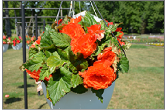
AmeriHybrid Ruffled Mandarin Orange Begonia in bloom

AmeriHybrid Ruffled Mandarin Orange Begonia is a fine choice for the garden, but it is also a good selection for planting in outdoor containers and hanging baskets. It is often used as a 'filler' in the 'spiller-thriller-filler' container combination, providing a mass of flowers and foliage against which the thriller plants stand out. Note that when growing plants in outdoor containers and baskets, they may require more frequent waterings than they would in the yard or garden.