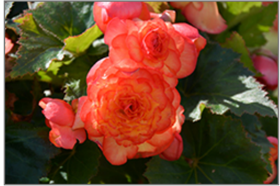
On Top Sunset Shades Begonia flowers