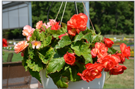
On Top Sunset Shades Begonia in bloom