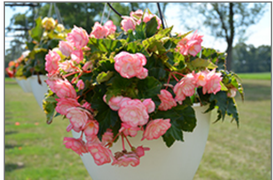
On Top Pink Halo Begonia in bloom