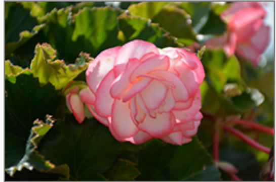
On Top Pink Halo Begonia flowers