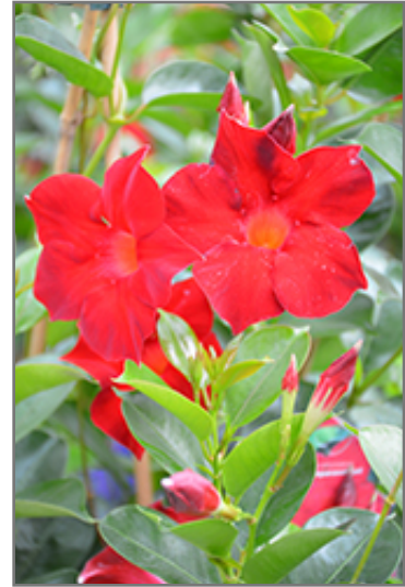
Sun Parasol Dark Red Mandevilla flowers

This tropical plant does best in full sun to partial shade. It requires an evenly moist well-drained soil for optimal growth. It is not particular as to soil type or pH. It is highly tolerant of urban pollution and will even thrive in inner city environments. This particular variety is an interspecific hybrid, and parts of it are known to be toxic to humans and animals, so care should be exercised in planting it around children and pets. It can be propagated by cuttings; however, as a cultivated variety, be aware that it may be subject to certain restrictions or prohibitions on propagation.