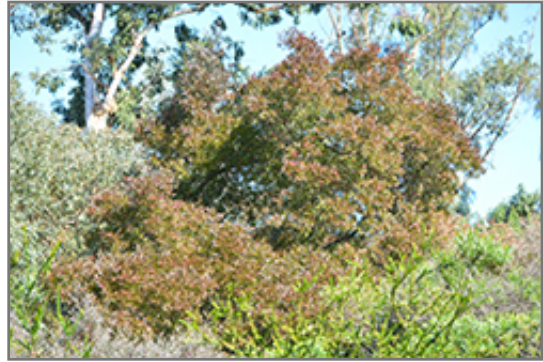
Purple Hop Bush

Purple Hop Bush makes a fine choice for the outdoor landscape, but it is also well-suited for use in outdoor pots and containers. Its large size and upright habit of growth lend it for use as a solitary accent, or in a composition surrounded by smaller plants around the base and those that spill over the edges. It is even sizeable enough that it can be grown alone in a suitable container. Note that when grown in a container, it may not perform exactly as indicated on the tag - this is to be expected. Also note that when growing plants in outdoor containers and baskets, they may require more frequent waterings than they would in the yard or garden.