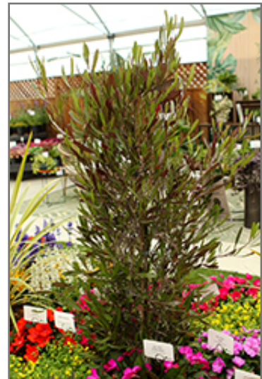
Purple Hop Bush