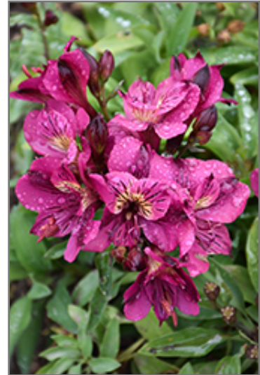
Colorita Louise Alstroemeria flowers

Colorita Louise Alstroemeria is recommended for the following landscape applications;