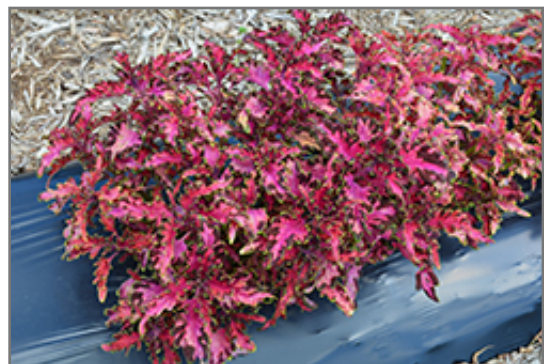
Under The Sea Pink Reef Coleus