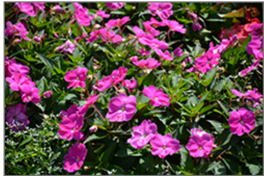
Infinity Lavender New Guinea Impatiens flowers