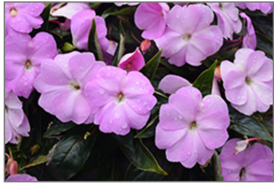
Infinity Lavender New Guinea Impatiens flowers

This plant will require occasional maintenance and upkeep, and should not require much pruning, except when necessary, such as to remove dieback. It has no significant negative characteristics.