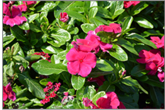
Cora Cascade Magenta Vinca flowers

Cora Cascade Magenta Vinca is recommended for the following landscape applications;