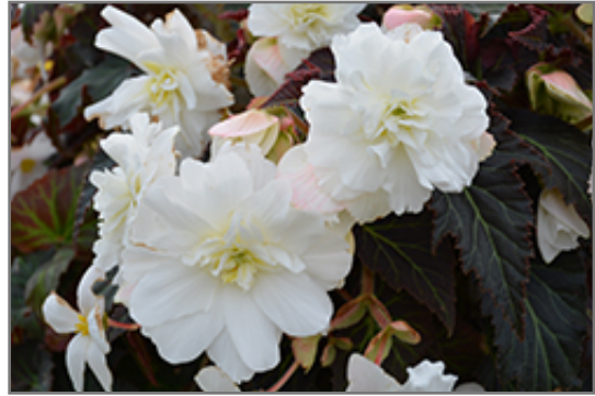
Nonstop Joy Mocca White Begonia flowers

Nonstop Joy Mocca White Begonia is recommended for the following landscape applications;