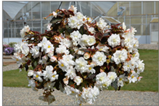
Nonstop Joy Mocca White Begonia in bloom