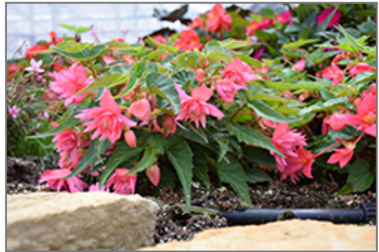
Funky Pink Begonia in bloom