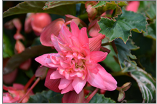
Funky Pink Begonia flowers

This is a high maintenance plant that will require regular care and upkeep, and usually looks its best without pruning, although it will tolerate pruning. Deer don't particularly care for this plant and will usually leave it alone in favor of tastier treats. Gardeners should be aware of the following characteristic(s) that may warrant special consideration;