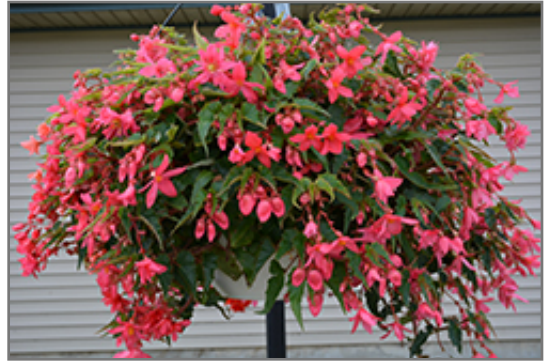
Funky Pink Begonia in bloom

Funky Pink Begonia is a fine choice for the garden, but it is also a good selection for planting in outdoor containers and hanging baskets. It is often used as a 'filler' in the 'spiller-thriller-filler' container combination, providing a mass of flowers and foliage against which the thriller plants stand out. Note that when growing plants in outdoor containers and baskets, they may require more frequent waterings than they would in the yard or garden.