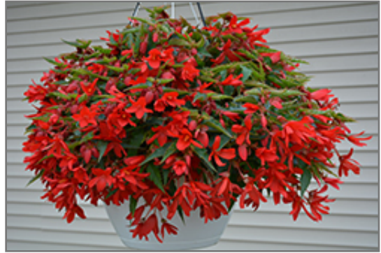
Bossa Nova Red Shades Begonia in bloom

Bossa Nova Red Shades Begonia is a fine choice for the garden, but it is also a good selection for planting in outdoor containers and hanging baskets. Because of its trailing habit of growth, it is ideally suited for use as a 'spiller' in the 'spiller-thriller-filler' container combination; plant it near the edges where it can spill gracefully over the pot. Note that when growing plants in outdoor containers and baskets, they may require more frequent waterings than they would in the yard or garden.