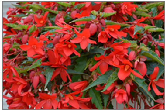
Bossa Nova Red Shades Begonia flowers