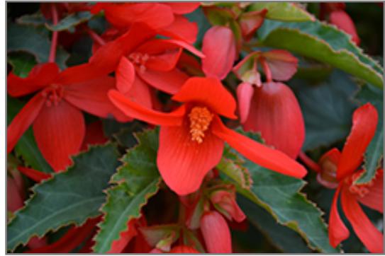
Bossa Nova Red Shades Begonia flowers

This is a high maintenance plant that will require regular care and upkeep, and usually looks its best without pruning, although it will tolerate pruning. Deer don't particularly care for this plant and will usually leave it alone in favor of tastier treats. Gardeners should be aware of the following characteristic(s) that may warrant special consideration;